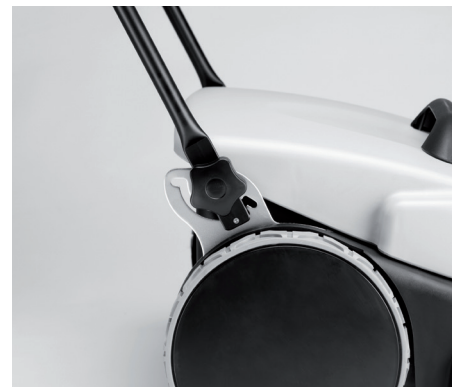
The handle can be adjusted to fit the operator height (3 positions)