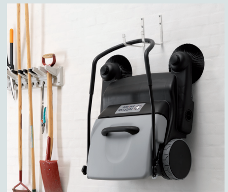
Clever handle/hopper construction keeps the hopper in place even when stored in the upright position or hung on a wall