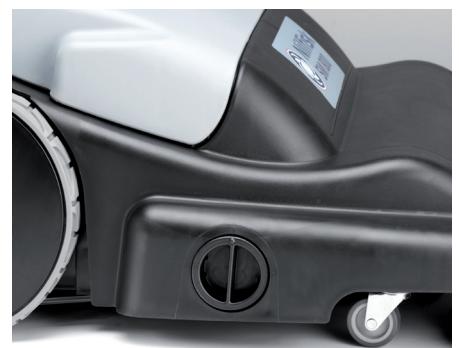
Main broom can be adjusted in 4 different positions without the use of tools.