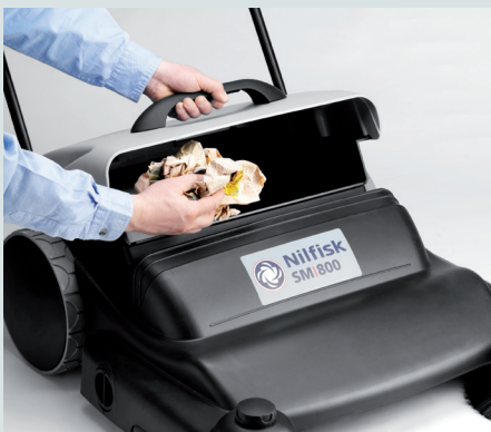
The hopper can stay in open position so it is easy to throw big items or empty a garbage bin into the hopper