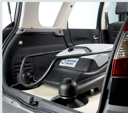
The handle can be folded without tools for storage and easy transportation